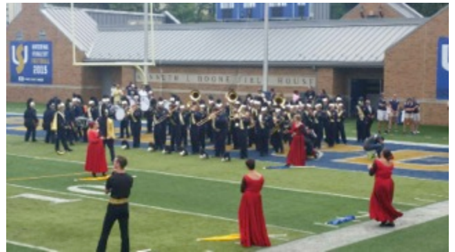
Pregame Stadium Jam 2016

The Shepherd University RAM Band will perform “feel good” music to celebrate the arrival of our new band uniforms. Music selections include: “Rock This Town” by Brian Setzer, “Can’t Stop The Feeling” by Justin Timberlake, “Hallelujah” by the Pentatonix, “Let The Good Times Roll” by Ray Charles and “Signed, Sealed, Delivered” by Stevie Wonder!