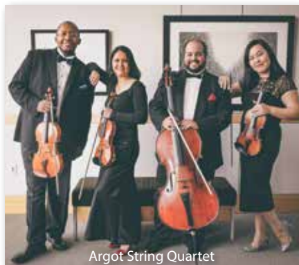
Argot String Quartet