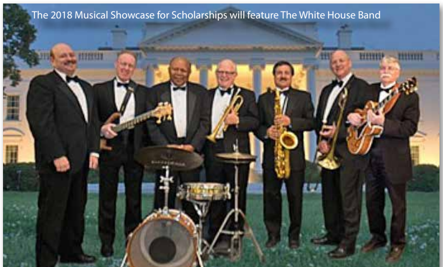
The 2018 Musical Showcase for Scholarships will feature The White House Band

If you are interested in supporting our 2018 Musical Showcase for Scholarships event and Shepherd University's Music Department, you can contribute through the Shepherd University Foundation, http://shepherduniversityfoundation.org .