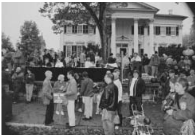
Last year's homecoming parade attracted a crowd.

Grab your running shoes, your water bottles, and friends for this year's Rams 5K run/walk. The event begins at 9 a.m. at the