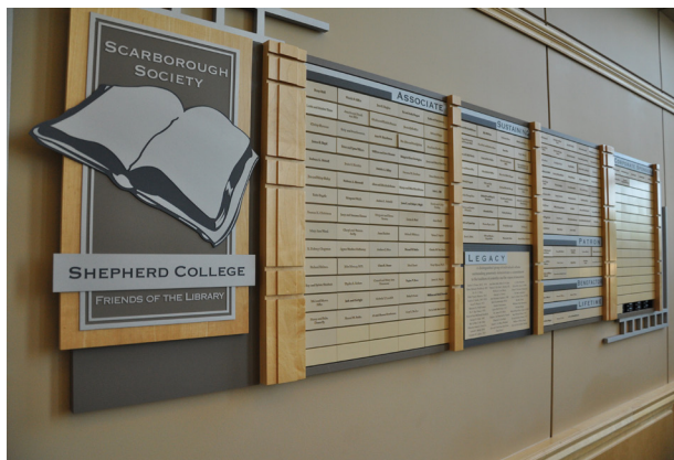
WALL OF HONOR

“Thanks to the support of our members and the sponsors and participants of our Gala, we continue to be able to deliver our vision of enhancing learning opportunities for Shepherd students and communities.”