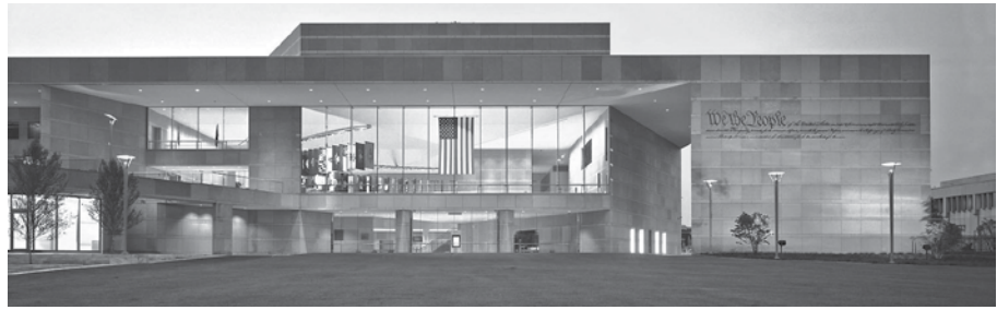
National Constitution Center