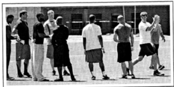
New York Giants quarterback Eli Manning, right, talks to a group of teammates during an unofficial practice hosted by Manning at Hoboken High School, Tuesday, May 10, 2011 in Hoboken, N.J. The workout gives the players an opportunity to practice together during the NFL labor lockout.