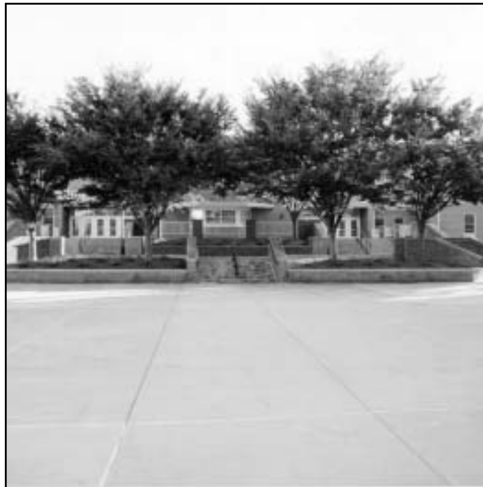
BUTCHER ATHLETIC CENTER